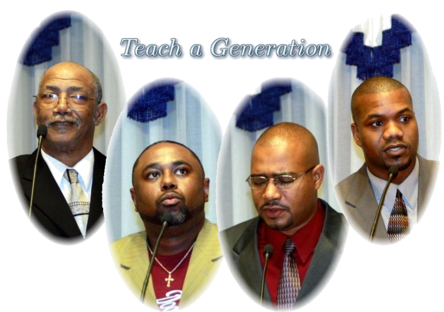
To Reach a Generation with Christ